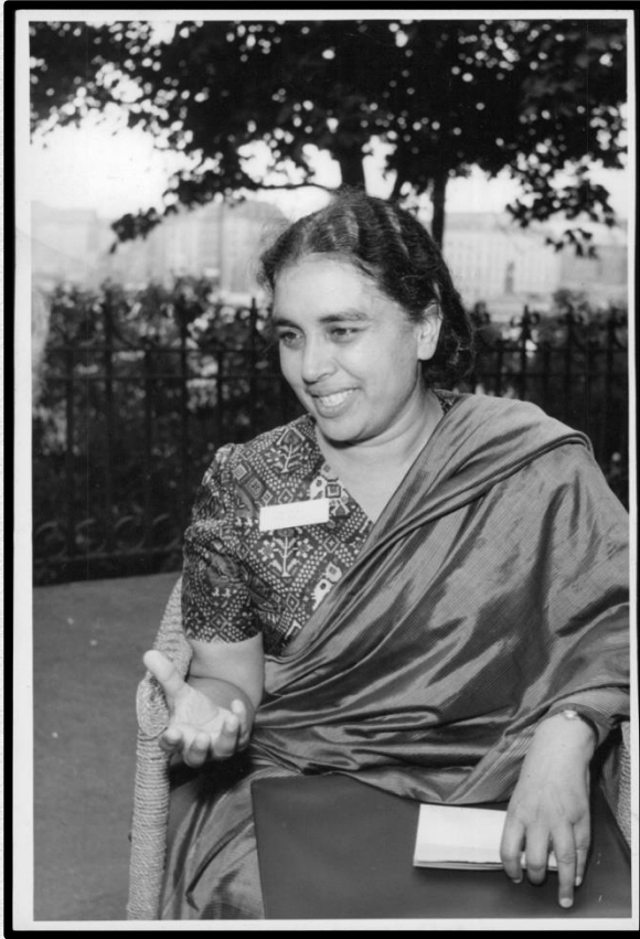
Dr. Sushila Nayar (1914-2001)