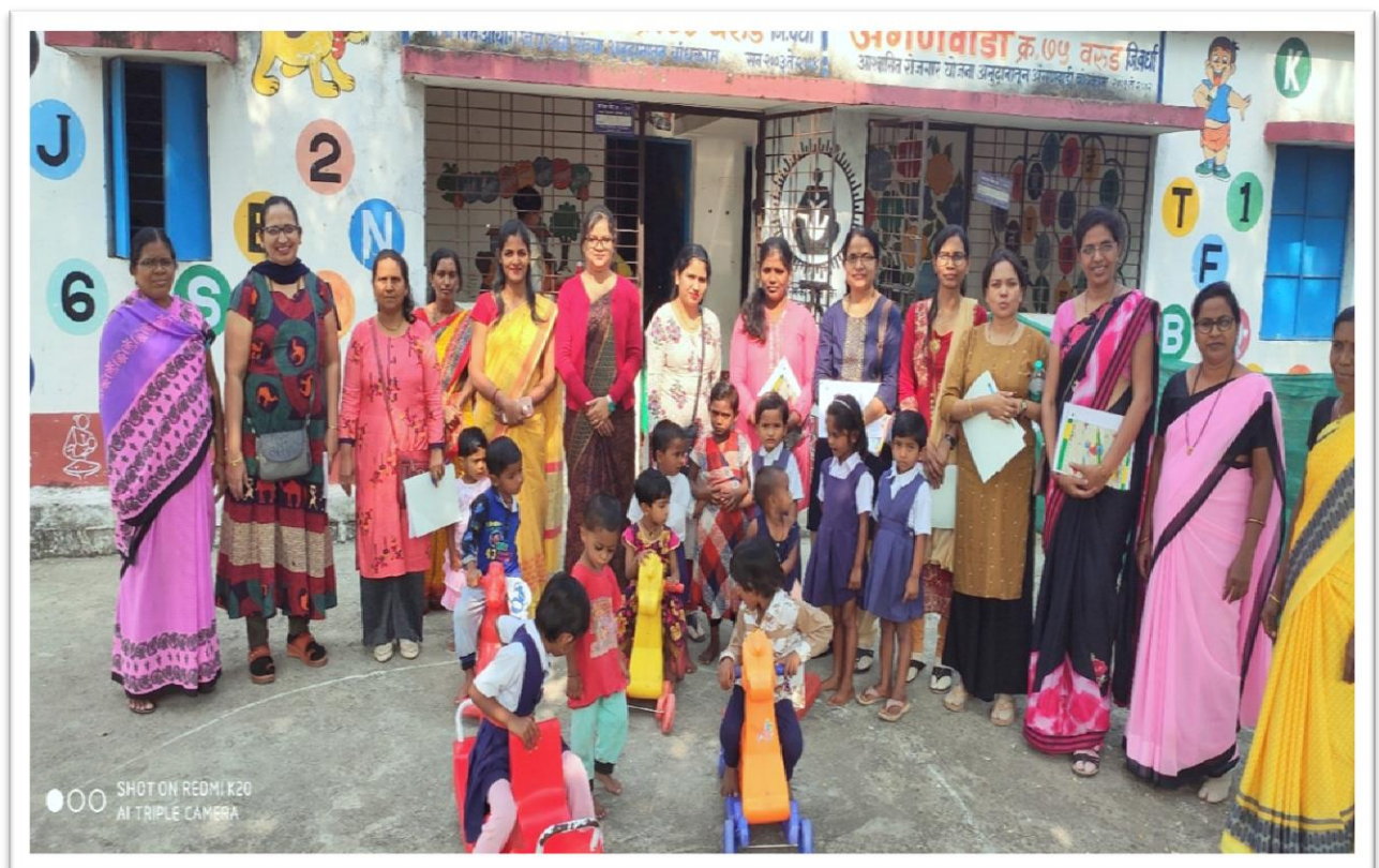
Visit to Anganwadi